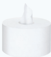
KLEENEX® Centre Pull Bath Tissue

The ideal solution for inclusive washroom design. Compliant with Australian Standards for accessible and ambulant facilities.